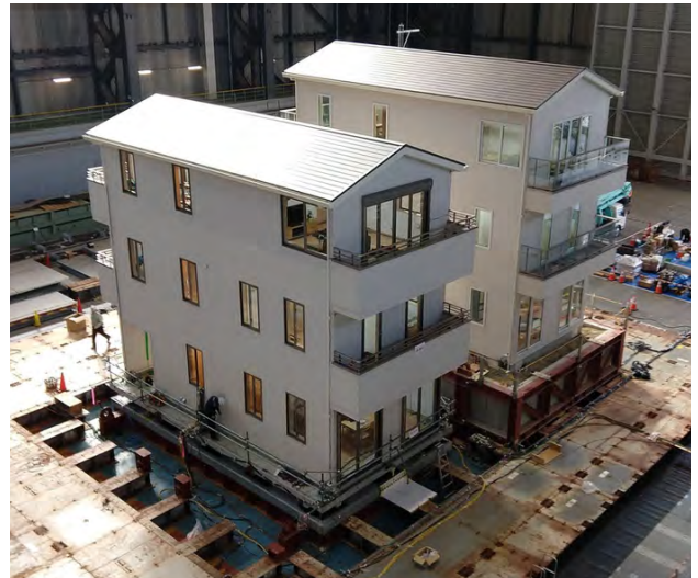
The full-scale testing took place at Japan's E-Defense facility.