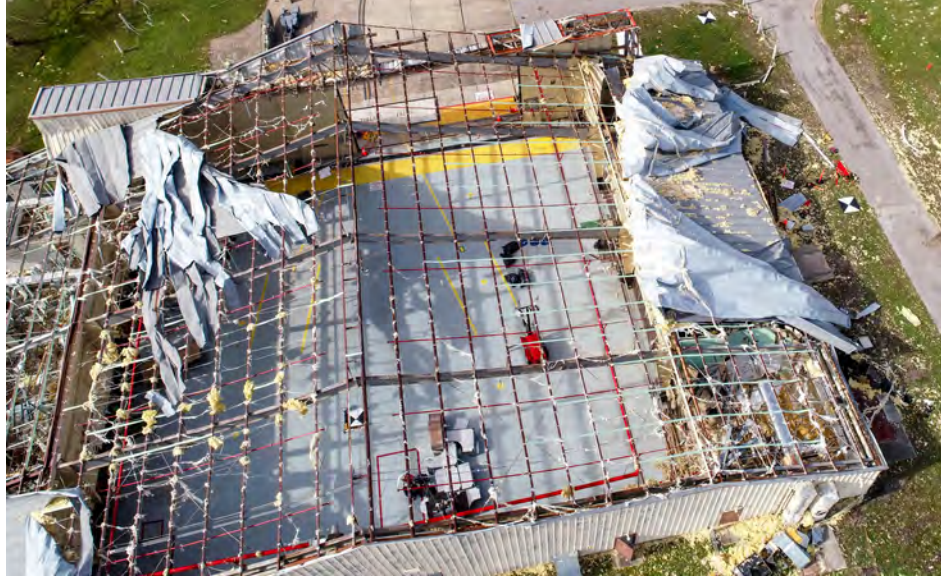
Captured by a RAPID drone, an aerial photograph shows wind damage on a large-scale industrial building following Hurricane Michael.

Researchers from Auburn University and the University of Washington traveled to the Florida panhandle in early November following Hurricane Michael, which made landfall in Mexico Beach, Florida, on October 10. An NSF-funded RAPID grant was awarded to assess the high failure rate of large-scale industrial buildings. The team utilized RAPID's extensive equipment portfolio, bringing along numerous cameras (DJI Osmo, Insta360, Canon DSLR, and Flir), DJI Phantom and Matrice 210 drones, the Leica TS16 and Maptek XR3 long-range scanner.