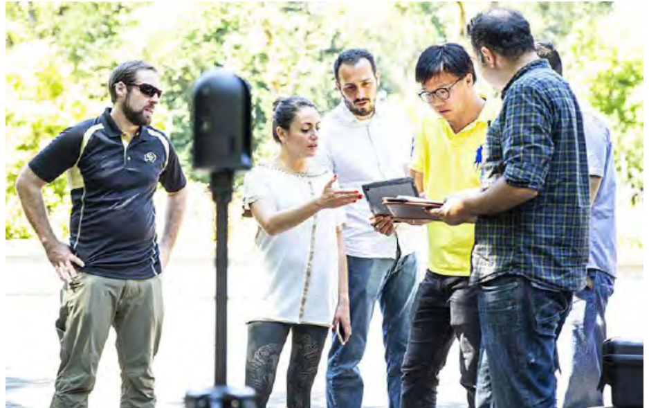
Visiting researchers learn how to operate the BLK360, a lightweight, highly accurate close-range lidar scanner used to capture 3D point-cloud and imagery data.

To enable systematic data collection, the RAPID facility developed a custom mobile application called the “RApp,” which guides researchers through standardized data collection methods. RApp manages multiple data types, from handwritten notes to photographs to 3D point clouds, automatically uploading everything to DesignSafe, NHERI's publicly accessible data repository.